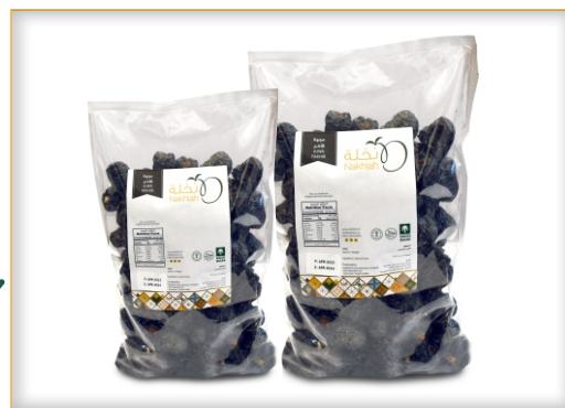
Packaging: Plastic Bag Weight: 1Kg