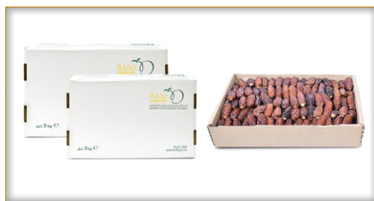
Packaging: Carton Weight: 3 kg | 5 kg