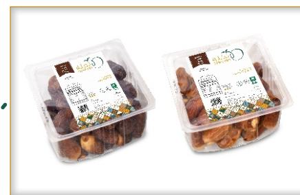
Packaging: Rigid Weight: 250g | 500g