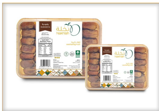
Packaging: Plastic Container Weight: 400g and 800g