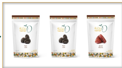
Packaging: Pouch Weight: 250g | 500g